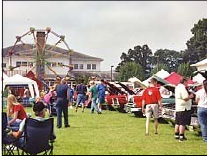
THE CLASSIC CAR SHOW at the Annual Waldensian Festival brings many onlookers to the longtime event in Valdese.

On Saturday, August 11, 2007 at 8:00 a.m., The Great Waldensian Foot